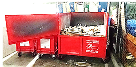
Basement car park bin has a split door for easy loading