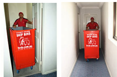
Internal access bin fits through a standard doorway

If you are removing tile & heavy waste such as bricks tile bedding then you will need to use the Internal Access Bins, these bins are able to be filled with heavy waste & have no load restrictions, however you must always check the elevator/lift load capacity as one Internal Access Bin fully loaded with heavy rubble can weigh as much as 850kgs.